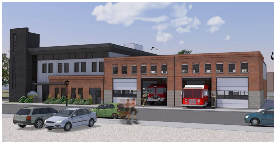
CSV Architects – conceptual exterior rendering

In addition to housing first responders, the facility features a new permanent Council Chambers that will double as the Emergency Operations Centre for the municipality on the fully accessible second floor.