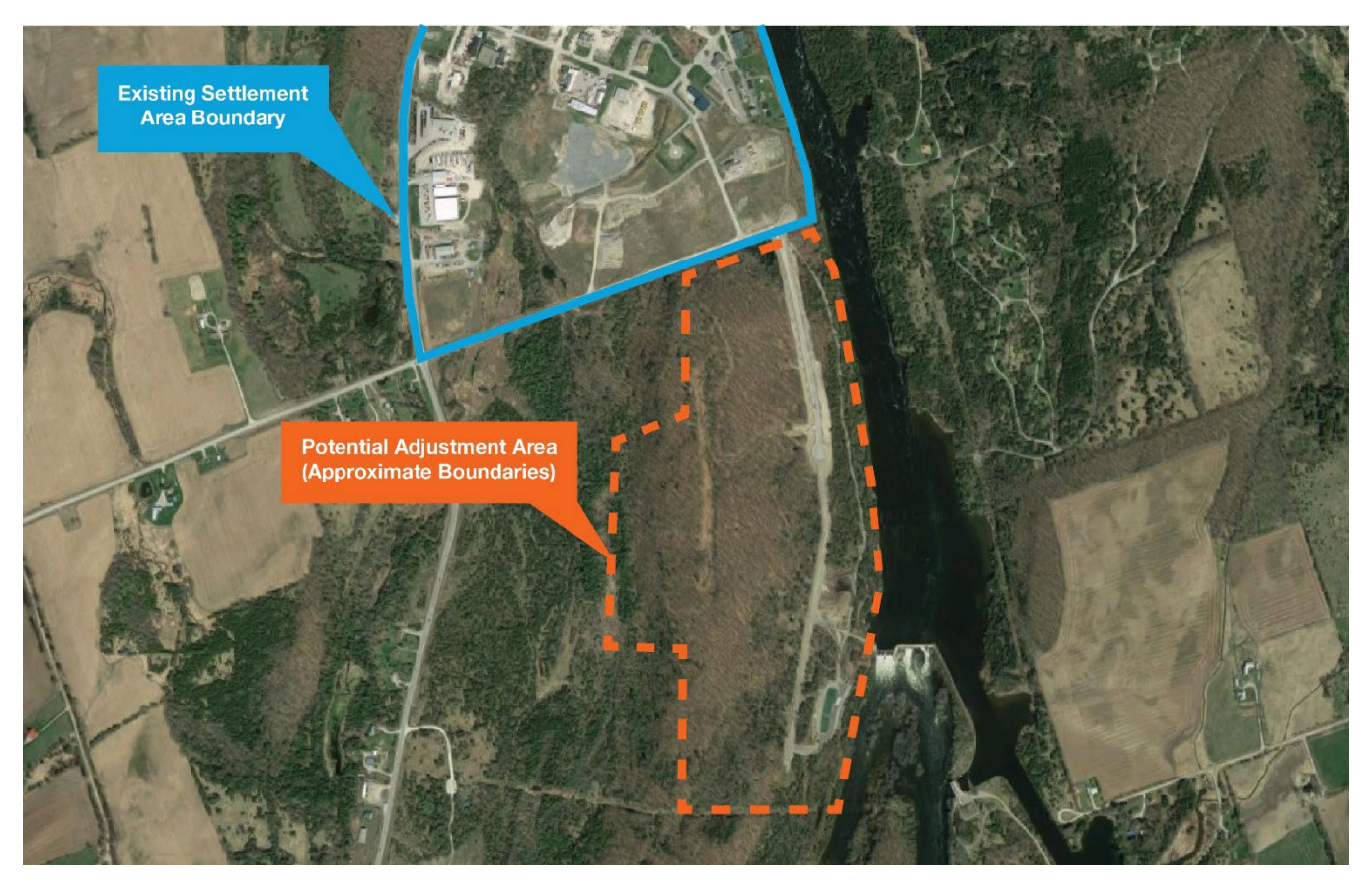
Figure 2: Potential Settlement Area Adjustment in Campbellford

The subdivision, marketed under the name "Haven on the Trent," includes approximately 44 lots that have been developed, along with 112 lots divided over the remaining development phases, as well as a park and stormwater management pond. Additional development areas are also envisioned within the overall landholding. All parcels are serviced with municipal water and sanitary services.